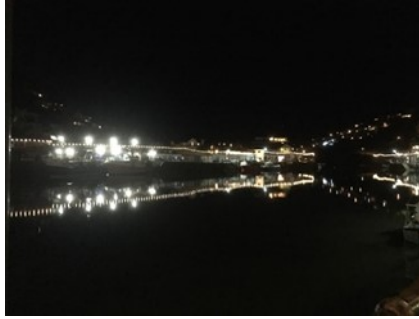
Lights over the river, Looe