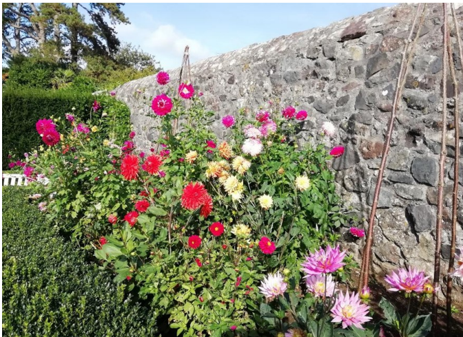
Part of the walled garden

The committee trusts they can count on your support for our Away Day's' to continue!