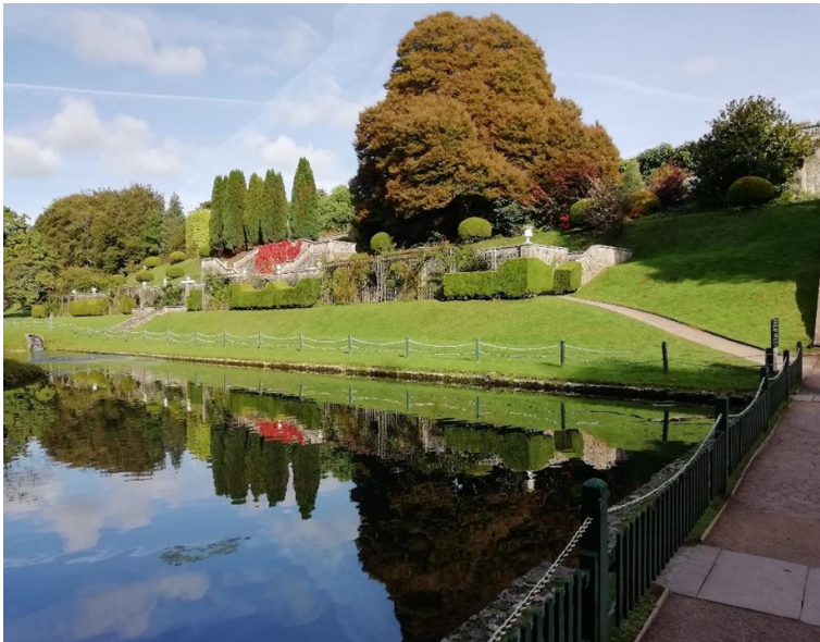
Part of the Italian Gardens