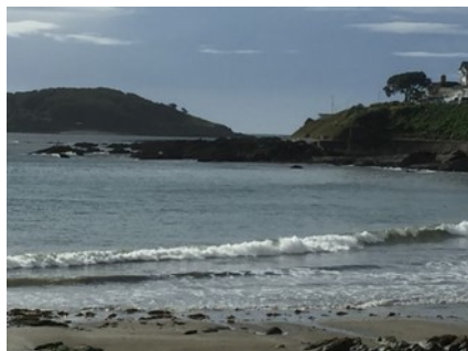
The beach at Looe